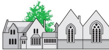
Bladon C of E Primary School